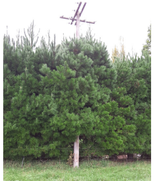
Examples of unsafe power poles and lines.

Disclaimer: This fact sheet is not an exhaustive list of all safety matters that need to be considered. Whilst care is taken in the preparation of this material, MainPower does not guarantee the accuracy and completeness of the information.